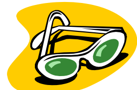
Wrap on sunglasses!