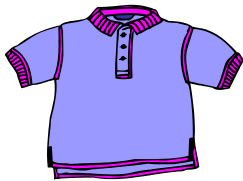
Slip on a shirt!