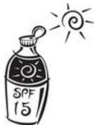
Slop on sunscreen!